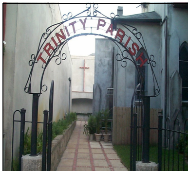
KING STREET ENTRANCE

In the case of those marriages in which one or both parties have been previously married, there are special Canons which apply. The divorce must have been finalized for a minimum of one year, after which time application must be made through the Priest of this Parish to the Bishop of the Diocese. If the Bishop gives consent to the marriage, premarital counseling will still be required (see #3 above). It is important that the divorced person demonstrates that appropriate obligations to the former partner are in place (such as child support, etc.). A copy of the final divorce decree will be required at the time of the initial application to the Bishop.